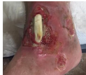
Day 0: Presentation with exposed and desiccated tibialis anterior (TA) tendon