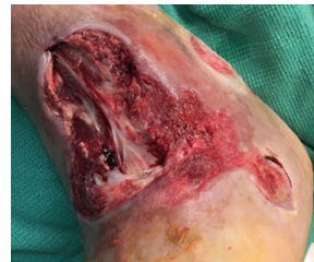
Day 0: Debridement